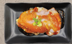
CHICKEN BULGOGI* 치킨불고기