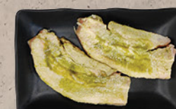
GREEN TEA SMOKED PORK BELLY* 녹차훈제삼겹살