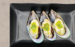
GREEN MUSSEL* 홍합