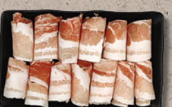
SLICED PORK BELLY* 대패삼겹살