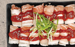
SPICY SLICED PORK BELLY* 매운대패삼겹살