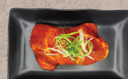
HWARO SPICY PORK RIB* 매운돼지갈비