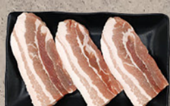
PORK BELLY* 삼겹살