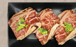
SHORT RIBS* 갈비살 갈비살