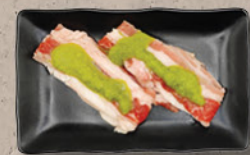
GARLIC JALAPENO BEEF BELLY* 마늘우경살