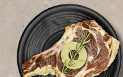
TOMAHAWK* 토마호크 (One Order Per Person)