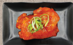
SPICY CHICKEN* 매운 치킨