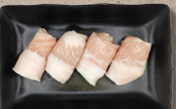
SIGNATURE PORK CHEEK* 향정살