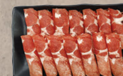
BEEF TONGUE* 소혀