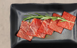
BEEF FLANK* 주물럭