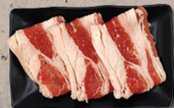
BEEF BELLY* 우경살