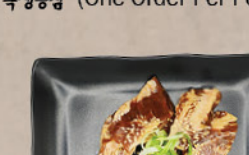
HARAMI MISO* 안창살 (Beef Skirt Steak)