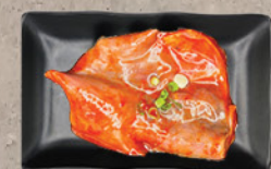
SPICY SQUID* 매운오징어