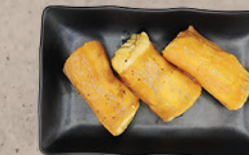
TRIPE* (Intenstine) 대창