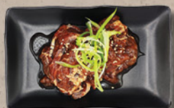
BEEF BULGOGI* 소불고기