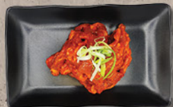
SPICY PORK BULGOGI* 매운돼지불고기