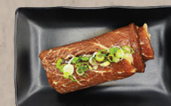
KING KALBI* 왕갈비 (One Order Per Person)