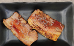
RED WINE PORK BELLY* 와인삼겹살