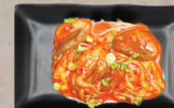
SPICY BABY OCTOPUS* 매운주꾸미 (One Order Per Person)