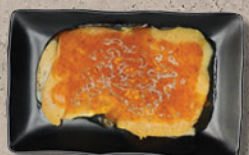
CAJUN CHICKEN* 케이준 치킨