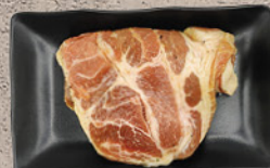
PRIME PORK RIB* 돼지갈비