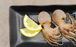
BABY OCTOPUS* 주꾸미 (One Order Per Person)