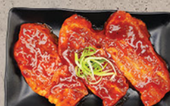
SPICY PORK BELLY* 매운삼겹살