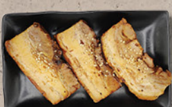
SWEET PORK BELLY* 달콤삼겹살