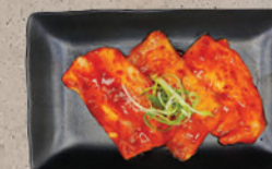
SPICY PORK CHEEK* 매운 향정살