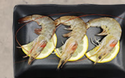
BUTTER SHRIMP* 버터새우 (One Order Per Person)