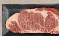
HWARO PREMIUM STEAK* 특생등심 (One Order Per Person)