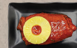
SPICY PINEAPPLE STEAK* 매운갈비살