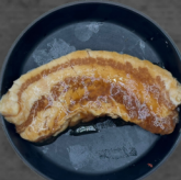
HONEY BEE PORK BELLY*