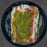
JALAPENO BEEF BELLY*