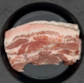
THICK CUT PORK BELLY*