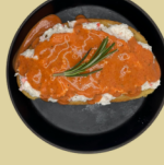
ROSE CRAB BRUSCHETTA