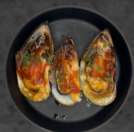
BAKED MUSSELS (2 PCS)