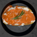
ROSE CRAB BRUSCHETTA