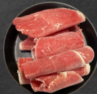
BEEF * SHOULDER