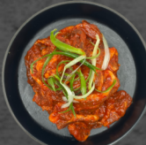
SPICY PORK BULGOGI*