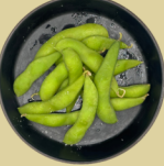
EDAMAME SALTED / SPICY GARLIC