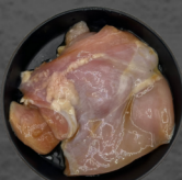
HONEY BEE CHICKEN*