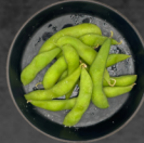
EDAMAME SALTED / SPICY GARLIC