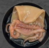
SQUID* (SWEET | SPICY)