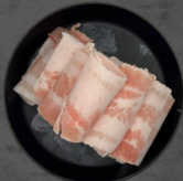
THIN SLICED PORK BELLY*